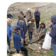
Geological teaching activities