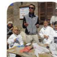
Soil teaching activities

Pann. 4b - The soil forming factors at Cimalegna plateau and vegetation.