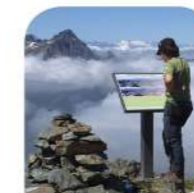
One of the panoramic panels